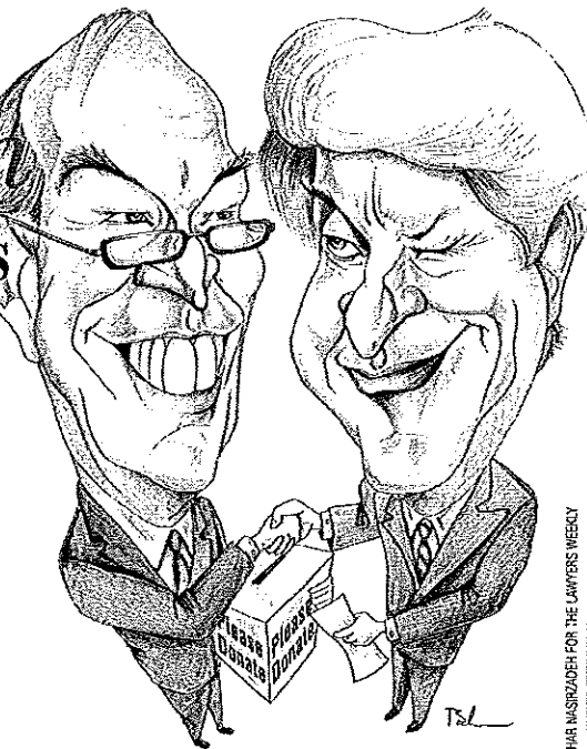
The Canada Revenue Agency has a mandate to carefully scrutinize tax shelter schemes involving charities.

ICAN applied to the Tax Court of Canada for a postponement of the suspension ( International Charity Association Network v. Canada , [2008] F.C.J. 500). In its affidavit, CRA stated that it was concerned by ICAN's participation in donation tax shelters, which had resulted in a significant increase of total revenue during this period — from